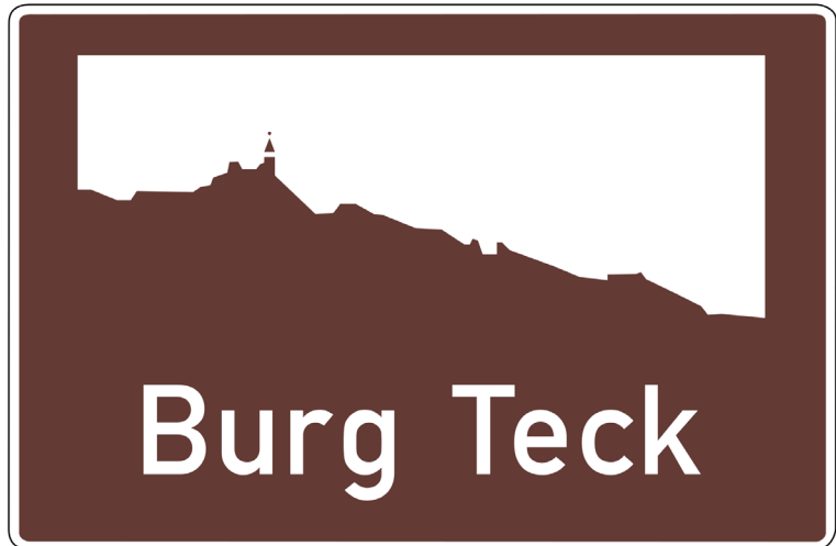
Figure 1: Sample sign

With the help of touristic brown signs, travellers on Autobahns are supposed to be informed about sights, cities and landscapes (Points of Interest, PoI) past which they are travelling. The signage, which has existed in Germany since 1984, is regulated [25] under the Road Traffic Act and the Guidelines for Touristic Signage (figure 386.3). It points out destinations that are either visible from the Autobahn or are in principle less than 10 km (as the crow flies) from an Autobahn junction. In exceptional cases, linear distance may be further afield than this and more than two signs may also be erected between two nodal points. These signs typically feature a symbolic representation of touristic attractions or geographical objects accompanied by a short description (see Figure 1) [13].